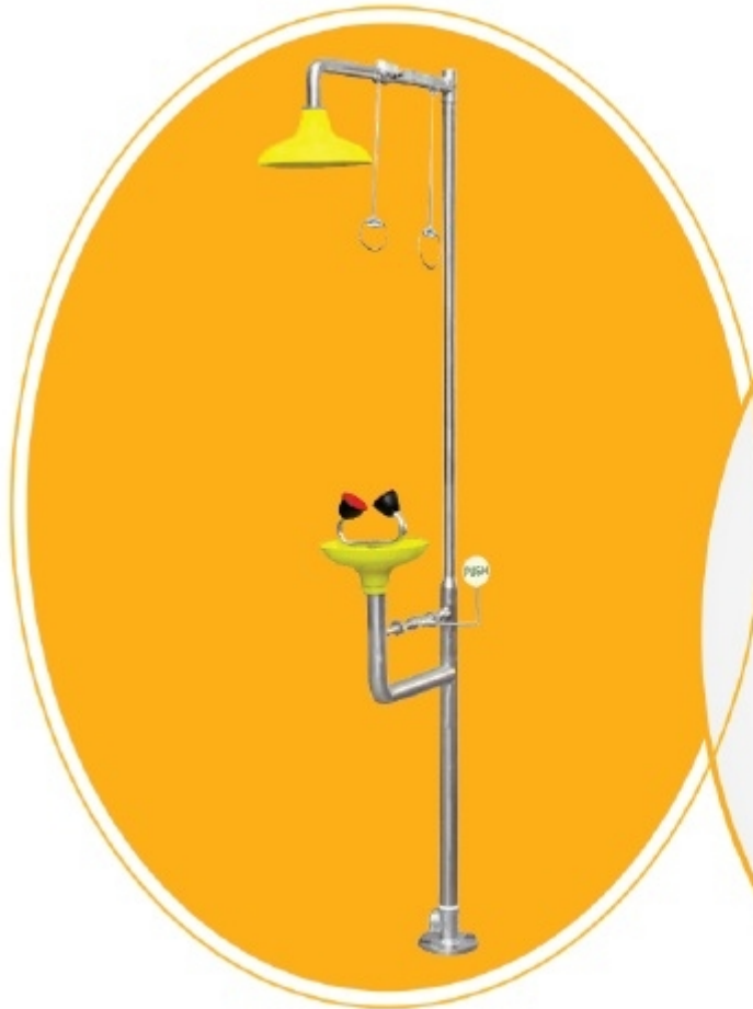
Safety Shower with Eye Wash