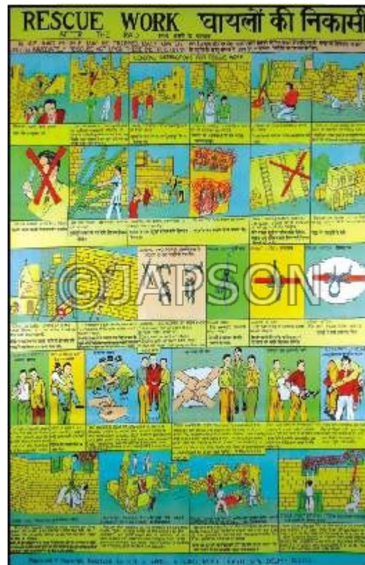
G. Charts, Your Duties - During War